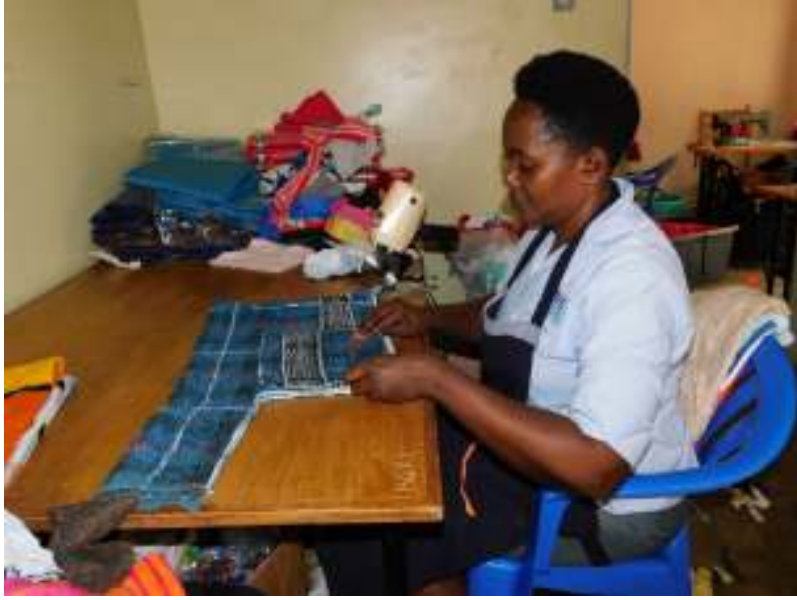
Hope for her